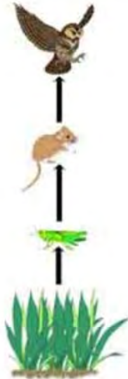
FOOD CHAIN (just one path of energy)